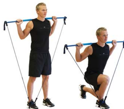
Rear lunge ( both loops in the front foot )