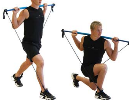
Lunge in a step position with body rotation