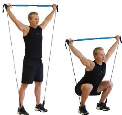
Squat with the stick held above your head