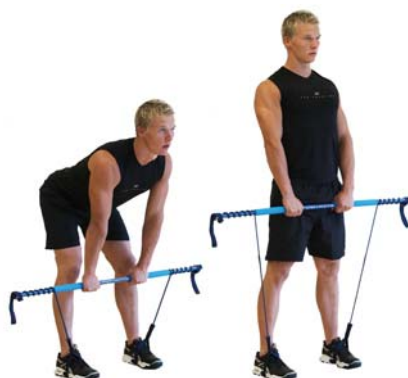
Straight leg dead lift